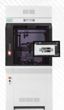
CP Watchparts Pick & Placer